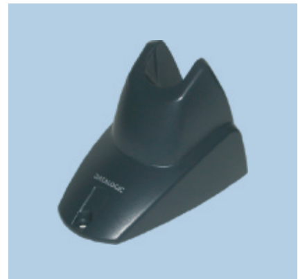
STD Heron™ Hands-Free Stand